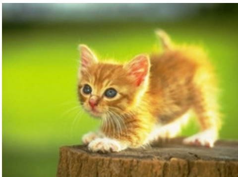
Figure 2-1 A figure