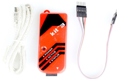
Microchip PICKIT3 clone (from fasttech.com)