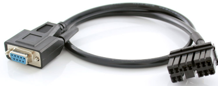
OVMS Tesla Roadster Vehicle Cable (from fasttech.com)