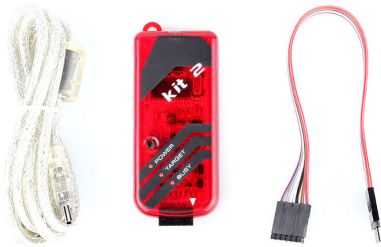
Microchip PICKIT2 clone (from fasttech.com)