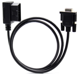
OVMS Generic OBDII Vehicle Cable (from fasttech.com)

You can either make this up yourself (the wiring is pretty simple – just 12V power, GND, CAN-L and CAN-H) or use either the Tesla Roadster or Generic OBDII cables.