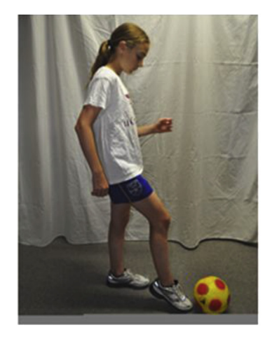
External Visual Imagery (3rd Person Perspective)

2.2.1.3. Comprehension of 'ease of imaging'. As a third issue, children's responses often indicated a lack of understanding of the concept of the ease of imaging and its relation to the Likert scale. To address this, photographs of three different glasses: one filled with