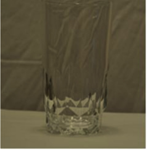
Empty Glass (Very easy to ... see or feel)

Glass of cloudy water (Not easy nor hard...to see or feel)