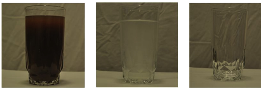
Glass of Mud (Very hard to ... see or feel)

Glass of cloudy water (Not easy nor hard...to see or feel)