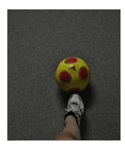
Internal Visual Imagery (1st Person Perspective)

2.2.1.2. Comprehension of kinesthetic imagery. Seventy percent of the children reported being unable to engage in kinesthetic imagery, saying they "couldn't feel anything". Four of the children said they based their answers on how easy it was to feel the actual movement, rather than the imaged feeling of the movement. Three