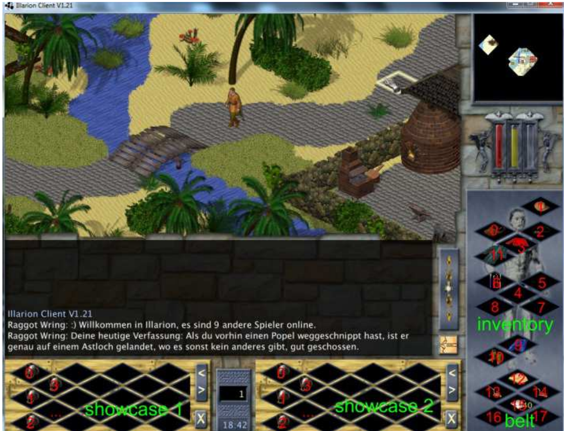
Figure 8.1.: Illustration for positions of items. Red: itempos , Green: getType